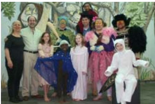
Things Whirligig," a children's musical based on