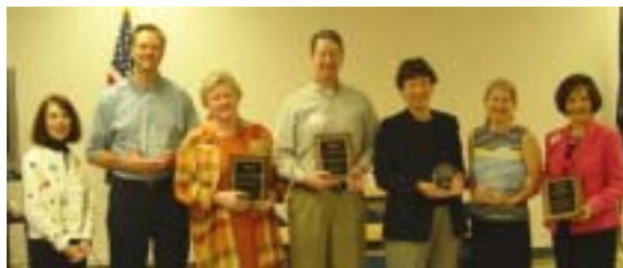
2004 FOSCL award winners

The annual FOSCL awards are an important way of saying "thanks" and supplying well-deserved recognition to individuals who have championed libraries in South Carolina. FOSCL solicits and welcomes nominations for these awards. Nomination forms and criteria are normally mailed to public library directors in the summer, to be shared with appropriate interested parties.