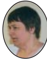
Faith Line Sumter County