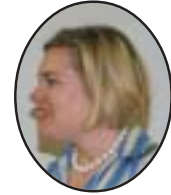
Johnson & Wales Charleston